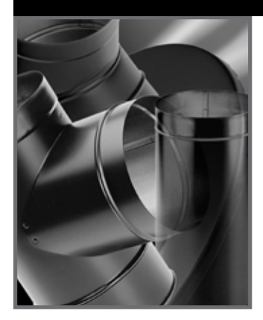
Single-wall interior stovepipe for connecting wood stoves to manufactured chimney