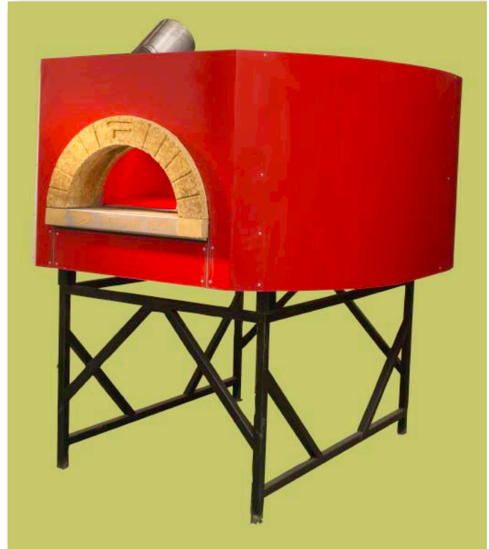
The Modena W Series—advanced technology in a fully assembled oven.

Tested to UL 737, UL Subject 2162-01, and NSF/ANSI 4-07.