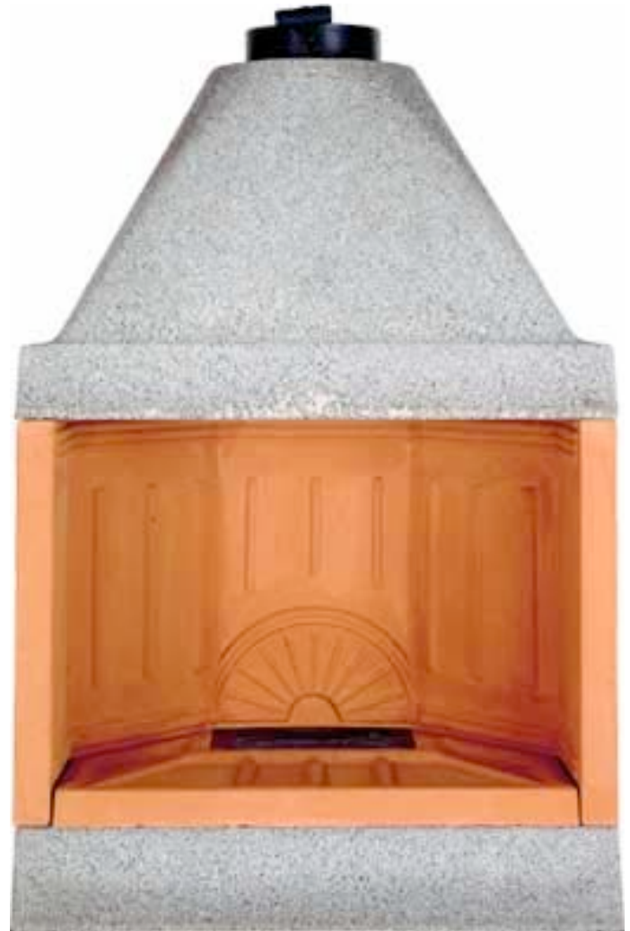
Forno Bravo Calore90

The fireplace chamber itself is cast as a single piece of refractory, a technique that is more expensive to produce, but also more attractive, more efficient with heat, easier to clean and easier to install than multi-part ovens. The Forno Bravo Calore outdoor fireplace kit gives you the sophistication of a custom-built installation -- without the cost, freeing you to finish your outdoor kitchen or living room with natural stone, tile, marble, stucco or granite.